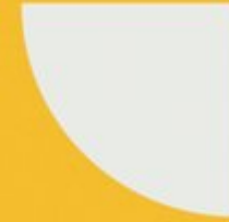
quart de cercle

Combien de demi-cercles forment un cercle ? Combien de quarts de cercle forment un demi-cercle ?