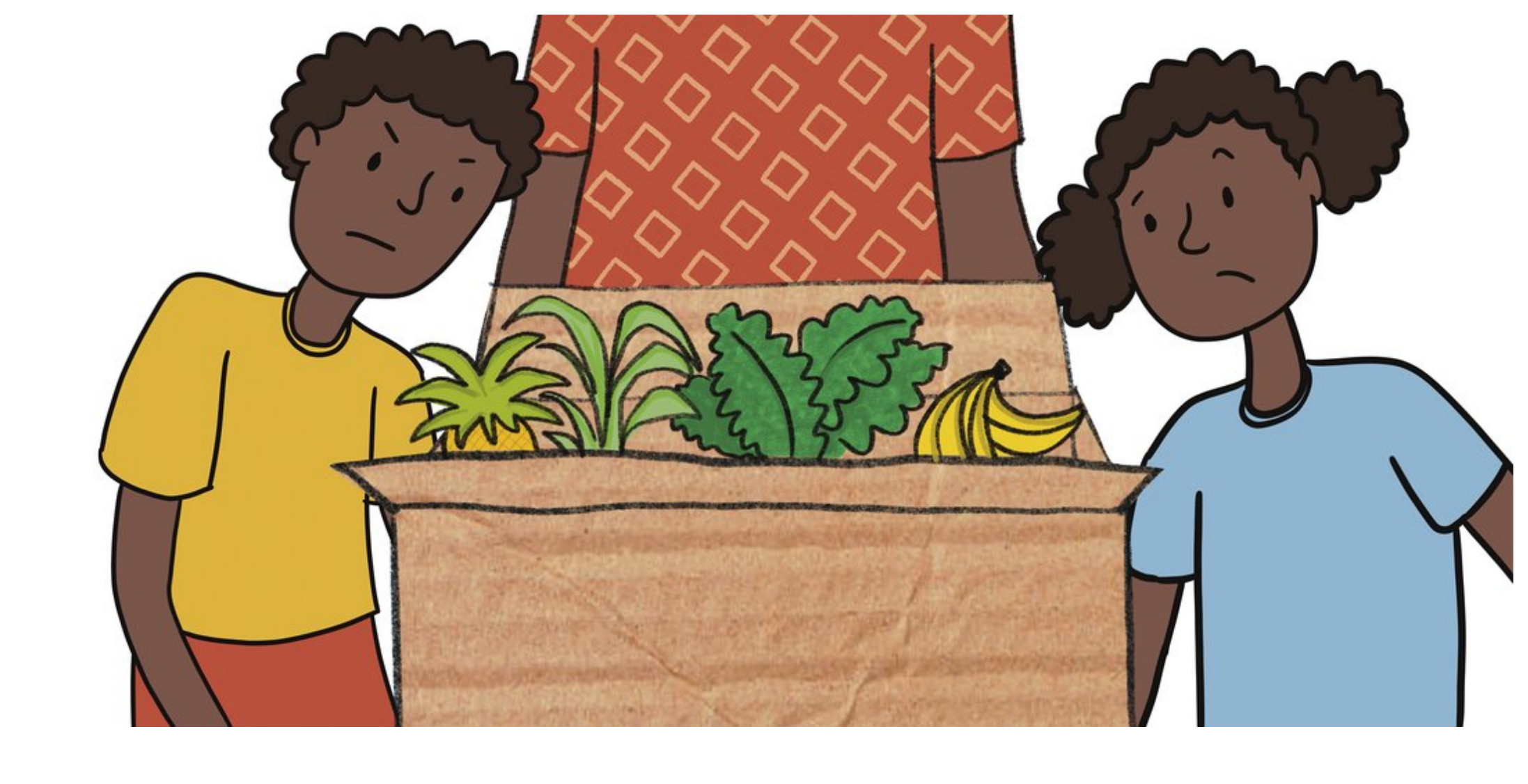
Ce ne sont que des fruits et légumes.