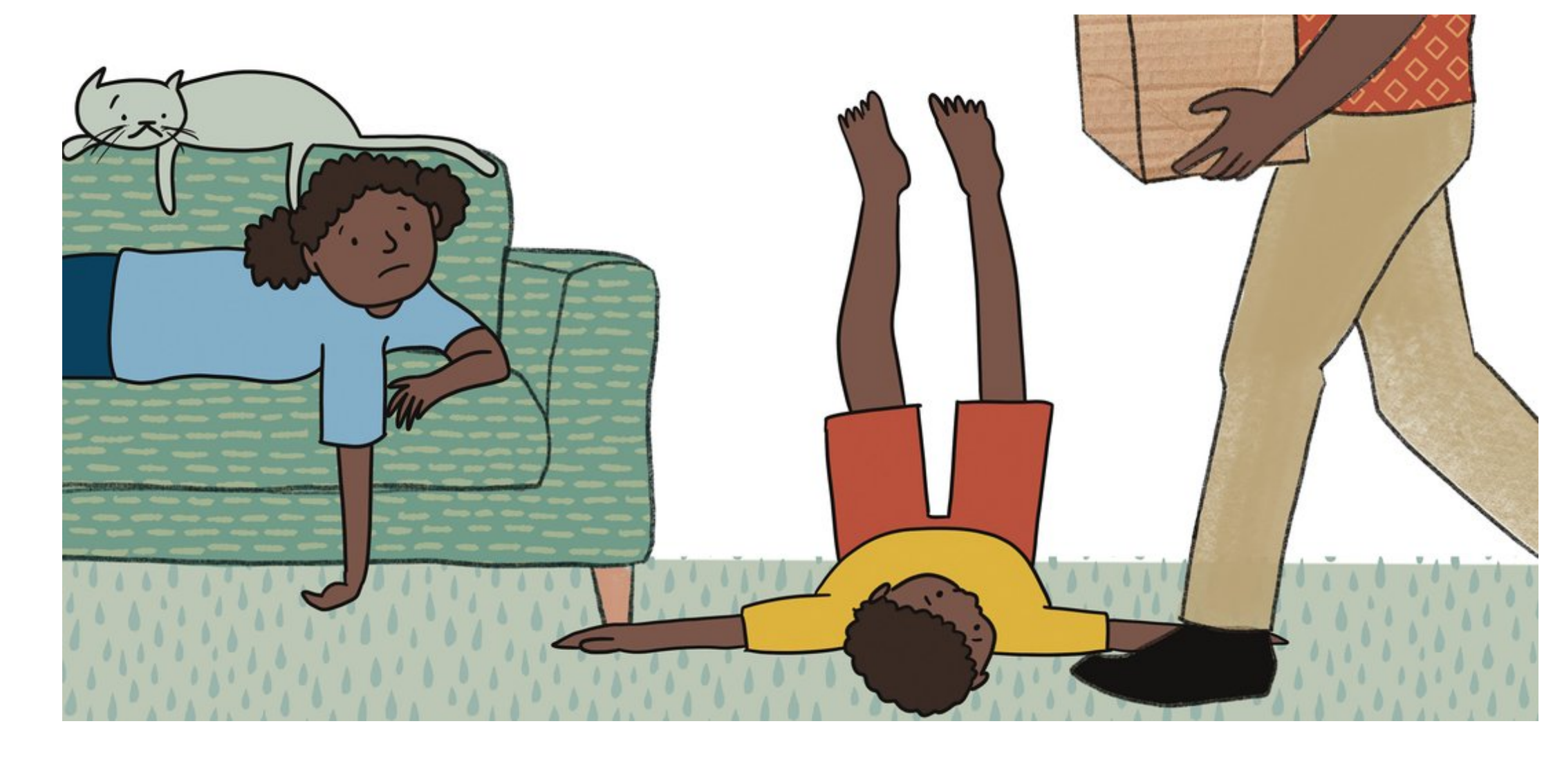
« Qu'y a-t-il dans la boîte, papa? »