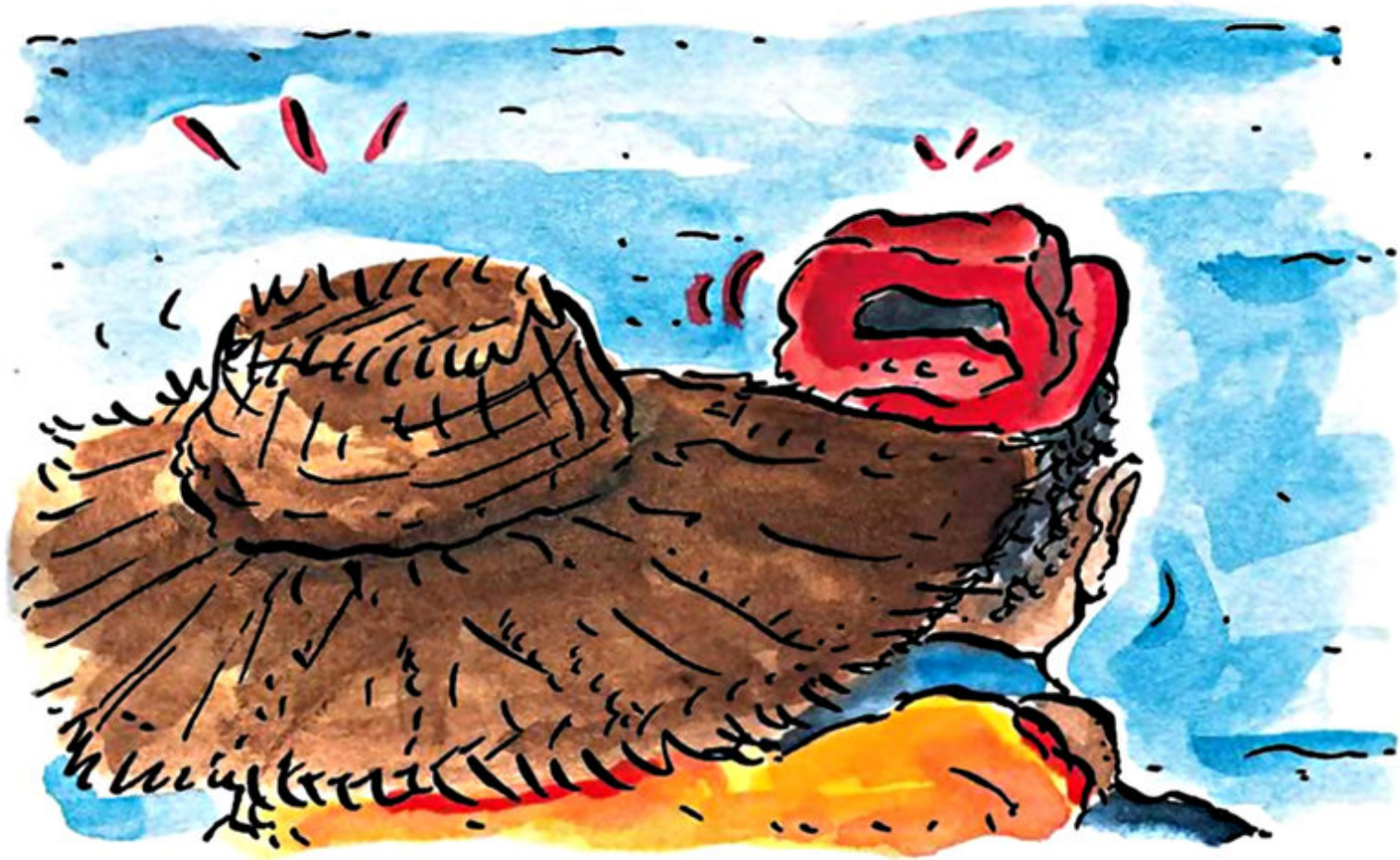
Grand chapeau. Petit chapeau.