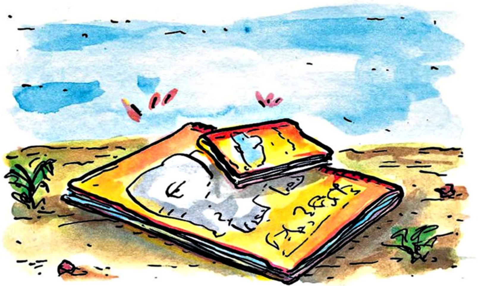
Grand livre. Petit livre.